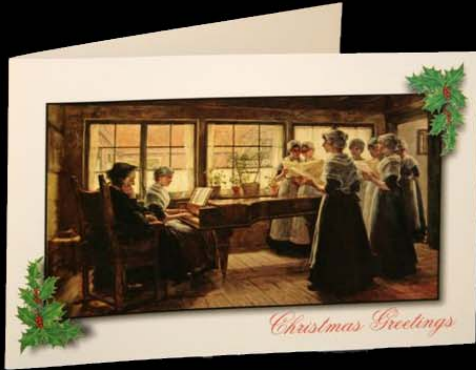
No.1 packet(s) of 10 Christmas Cards with envelopes