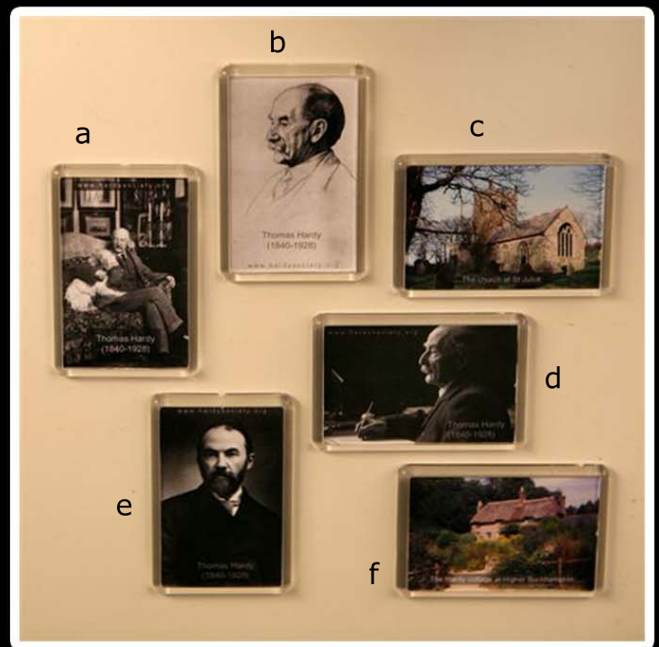
No.3 Fridge Magnets