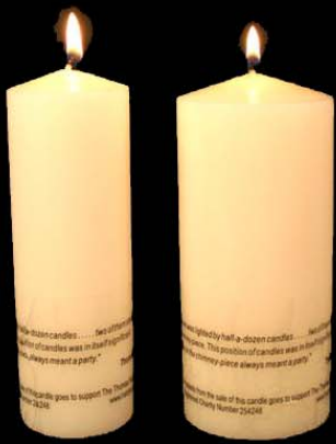
No.4 Candle(s) 2" or 2.3/4" diameter