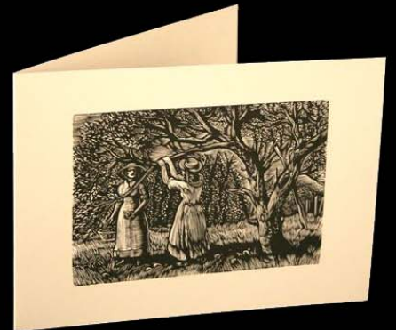
No.9 Notelet Cards of Wood engravings by Peter Reddick