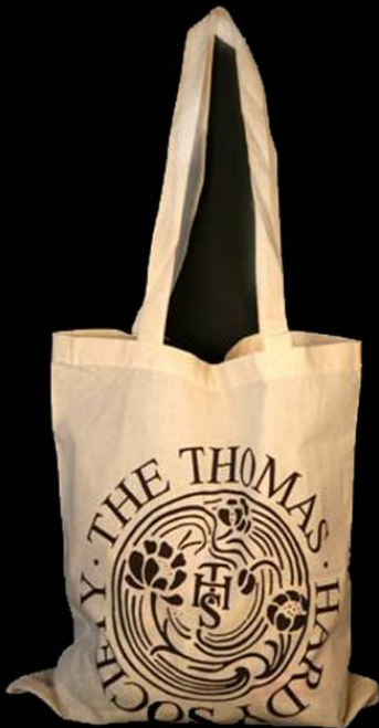
No.6 Calico Bag with logo