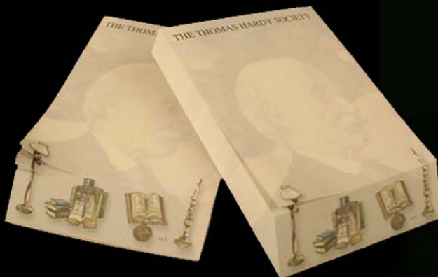
No.5. Colourful Jotting Pads size approx: 5" x 4"